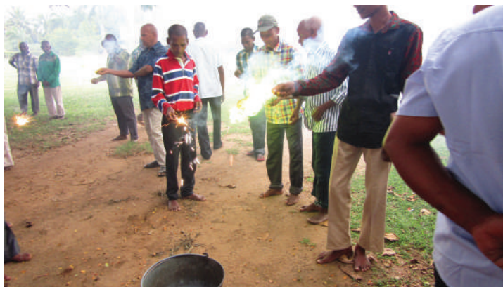
Diwali celebrated at Thanjam Home