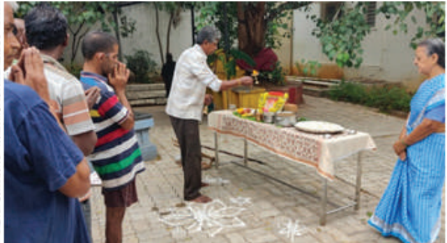
Ayudha Pooja celebrated at Thiruvannamalai Ayudha Pooja celebrated at Thiruvannamalai