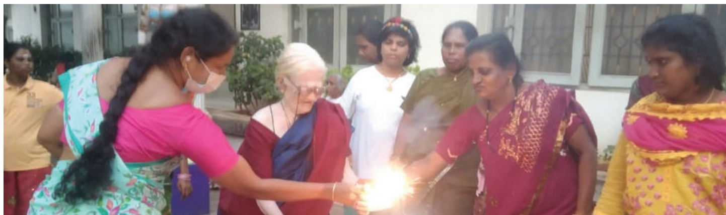
Diwali celebrated at Karunaiillam Chennai Home Diwali celebrated at Ramana Rehabilitation

Diwali 2022 was celebrated at various Udavum Karangal Homes in Chennai, Coimbatore and Thiruvannamalai. The residents had a good time, it was a day filled with joy for them. All the residents admired the lighting works. It was a feast for their eyes. Later sweets and snacks were distributed. They were also served scrumptious meals.