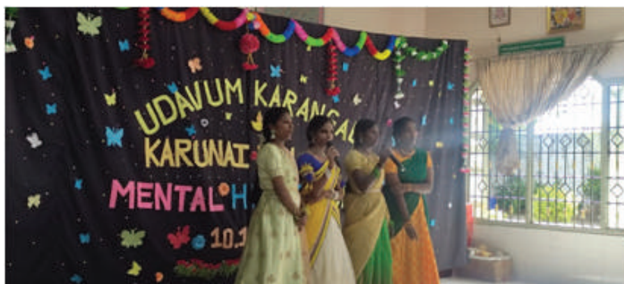
Resident girls singing at Karunai Illam Home Chennai