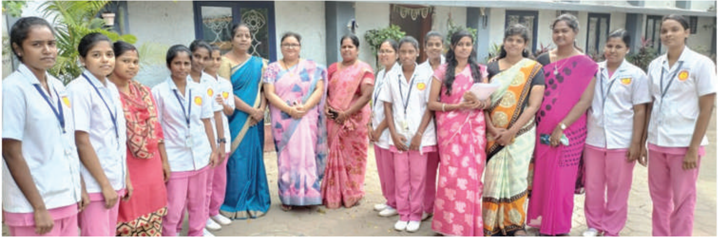
Students of Shenbaga College of nursing visited our home 8.12.2022