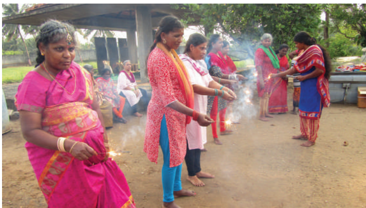
Diwali celebrated at Sakthivanam Home Coimbatore