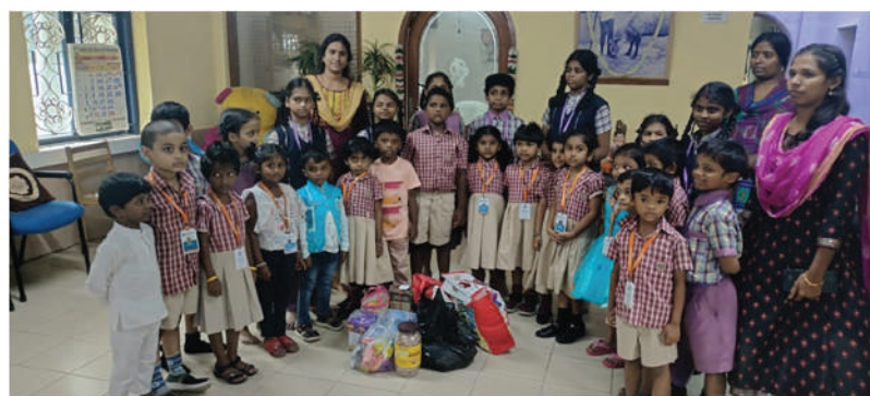
Narayana e-tech school visited Shanthivanam Home on 14.11.2022 and donated essential items and interacted with the children