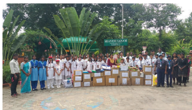
The students of Vellammal School visited Shanthivanam Home on 14.11.2022 and donated essential items and interacted with the patients