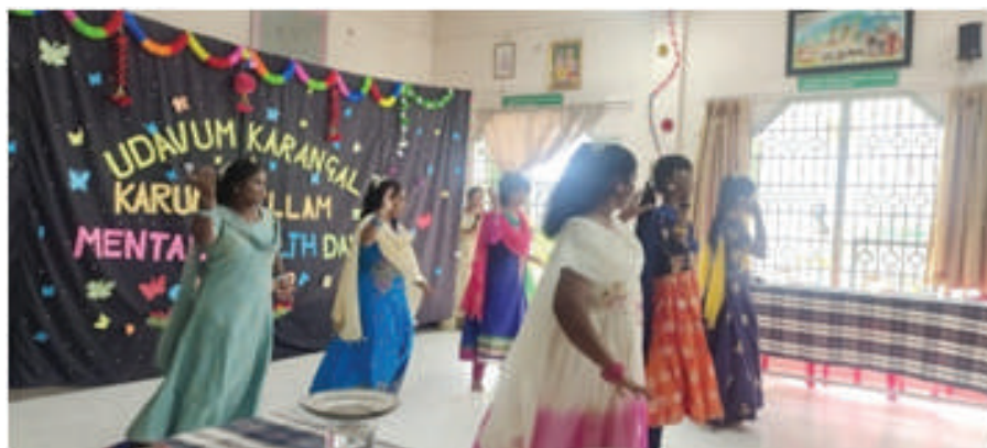
Residents performing a dance at Karunai Illam Home Chennai