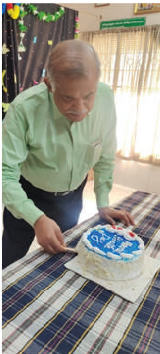
Cake cutting was done by Pappa-Vidyaakar Founder of Udavum Karangal as a part of Mental Health Day Celebration

Volunteers and staff utilized this opportunity to learn more about these mentally ill patients and try to help them better.