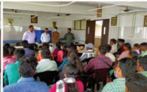
CPR Training programs conducted by Gayathri Hospital Joined with phy sio Med Therapists 11/06/2022