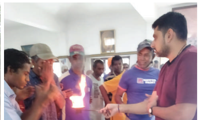
Ayudha Pooja celebrated at Sondham Ayudha Pooja celebrated at Sakthivanam