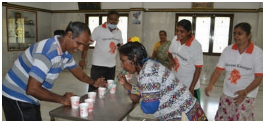
Mental Health day celebrated at Coimbatore Home