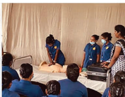
Gayathri Hospital conducted CPR Training for Shenbagha College of Nursing 11/07/2022